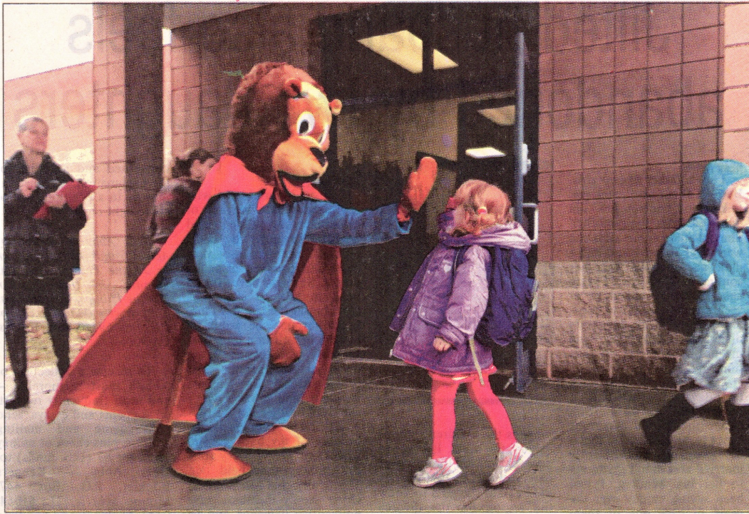
Above: Roary the Lion gives a student a high-five.