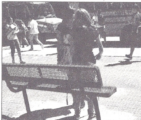
A pair of friends catch up outside of Coventry High after the school's first day of classes let out yesterday afternoon.

"I get to talk to the parents, along with