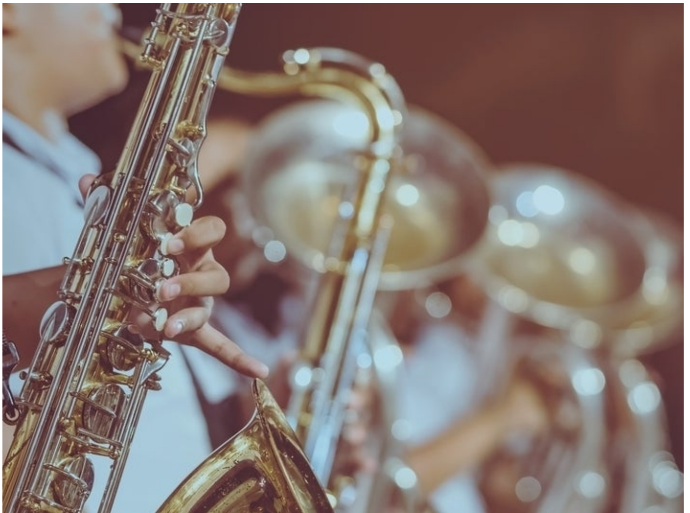
13 Coventry High School students were selected to take part in this year's Rhode Island All-State Music Festival.